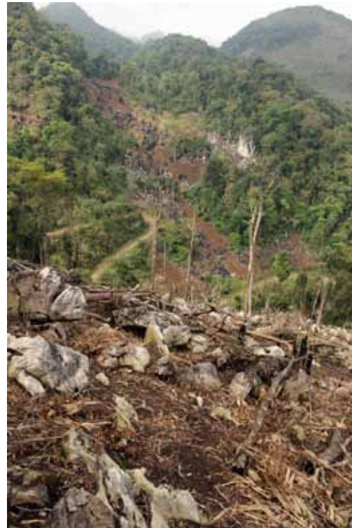
Fig. 10. Primitive maize fields replacing natural habitat of Paphiopedilum canhii

Primitive slash-and-burn agriculture and forest logging for domestic purposes and fuel are the main reasons for deforestation in areas of rapidly increasing human populations. Degraded pieces of remaining primary forests are presently estimated as less than 0.5% of the territory. Such unique remnant forest areas still occur in a few remote mountain regions. Their protection and conservation are impossible without urgent action of municipal, provincial, and governmental authorities. Without urgent and effective