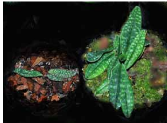
Comparison of plants of Paphiopedilum rungsuriyanum (left) and Paphiopedilum canhii (right)

http://orchideenjournal.de/permalink/GRUSS_RUNGRUANG_YONYOUTH_CHAISURIYAKUL_DIONISIO_Paphiopedilum.pdf