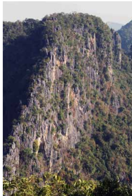
Fig. 5. Typical remnant eroded limestone mountains in Son La Province at elevations of 2600-3250 ft.