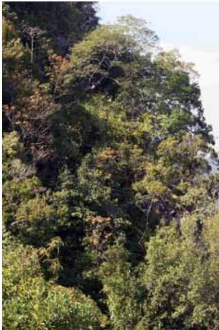
Fig. 6: Rich, primary, broad-leaved evergreen, humid tropical forests in the Paphiopedilum canhii area

Rich, primary, broad-leaved evergreen, closed submontane tropical forests represent the typical original pristine vegetation type within the area of Paphiopedilum canhii (Fig. 6). The presence of very diverse species, specific horizontal and vertical forest structures, permanent shade and humidity, as well as an absence of exotic or weed