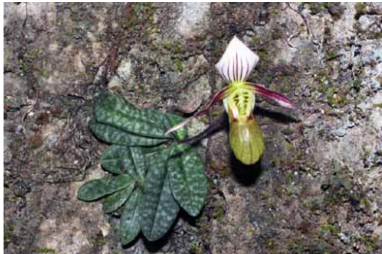
Fig. 1. Paphiopedilum canhii in its natural habitat on a vertical limestone cliff

A research expedition program funded by The Rufford Small Grant Foundation, the American Orchid Society and the Chicago Zoological Society (Chicago Board of Trade Endangered Species Fund) to undertake a field assessment of the recently described species Paphiopedilum canhii has been completed. New original data relating to habitat and natural conditions of five subpopulations have been obtained. Associated plant species and vegetation have been described and documented. The factors leading to rapid extinction are analyzed and discussed. The data obtained support an assessment of the present status of the species as critically endangered, approaching full extinction in the near future. Conservation of this species in its natural habitats (Fig. 1) would require very urgent actions that may be unrealistic, and ex-situ cultivation of the species may be the only way to effectively prevent its imminent extinction. Some recommendations for approaches to orchid protection are briefly proposed.