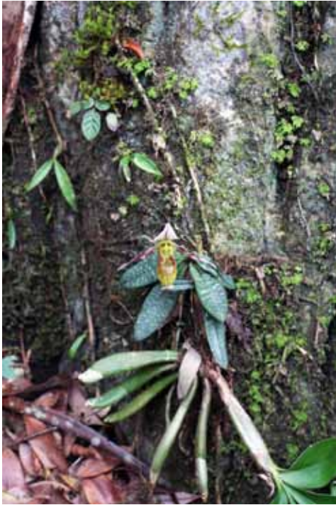
Fig. 7: Paphiopedilum canhii in its natural habitat, growing on vertical cliffs covered with orchids and mosses, in stable humidity and shade