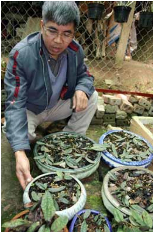
Fig. 8: Paphiopedilum canhii in local nurseries of Dien Bien City

Naturally, this large influx of plants rapidly exceeded the demand and very soon prices fell from US $100 per plant to US $50 per kilogram. By the end of 2010, prices had continued to fall and prices of US $10-20 per kilo were common. Even at these prices, trade had seriously weakened; nearly all plants that did not sell were simply destroyed. Ironically, the wholesale collecting of the great majority of plants from their habitat was for no purpose. They brought no money to local people, no profits to local or international traders and no happiness to orchid lovers all over the world. These last specimens of this unique, critically endangered species, threatened with imminent extinction, were simply wasted. The lack of horticultural knowledge and experience necessary for successful slipper orchid cultivation prevents P. canhii from being successfully grown in local collections and nurseries. Even large flowering-size plants have little chance of survival in these conditions (Fig. 8). At the end of 2010, trade in P. canhii had completely stopped for three main reasons: having already purchased the best cultivars necessary for propagation and breeding, demand from foreign traders was gone, due to the difficulties encountered