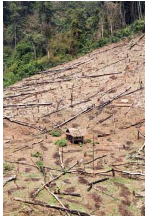
Fig. 11. Full collapse of rich, native vegetation through forest burning for agriculture