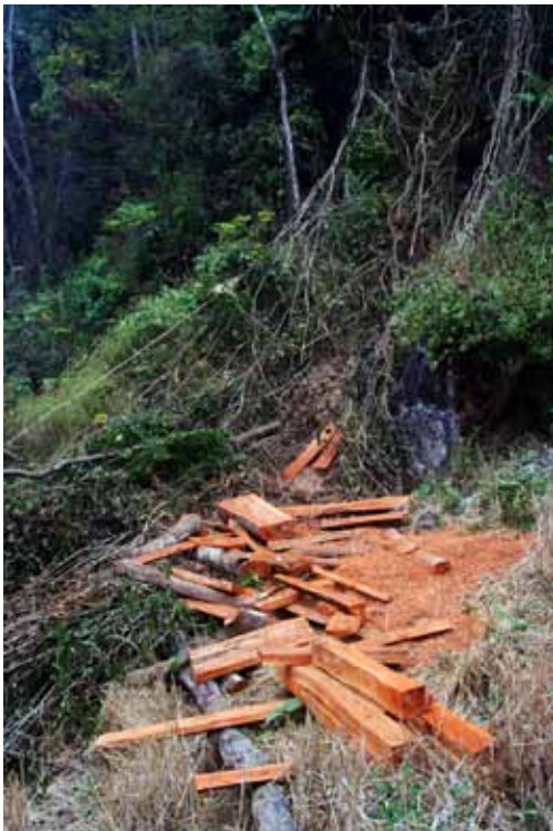
Fig. 9. Logging of canopy of primary forest in Paphiopedilum canhii area