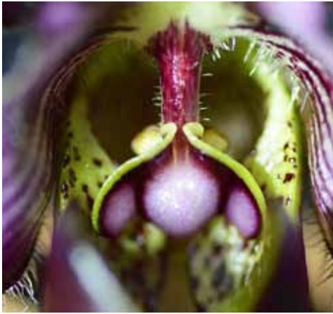
Staminodium with column

Front view of two different clones (left) and a side view (right)