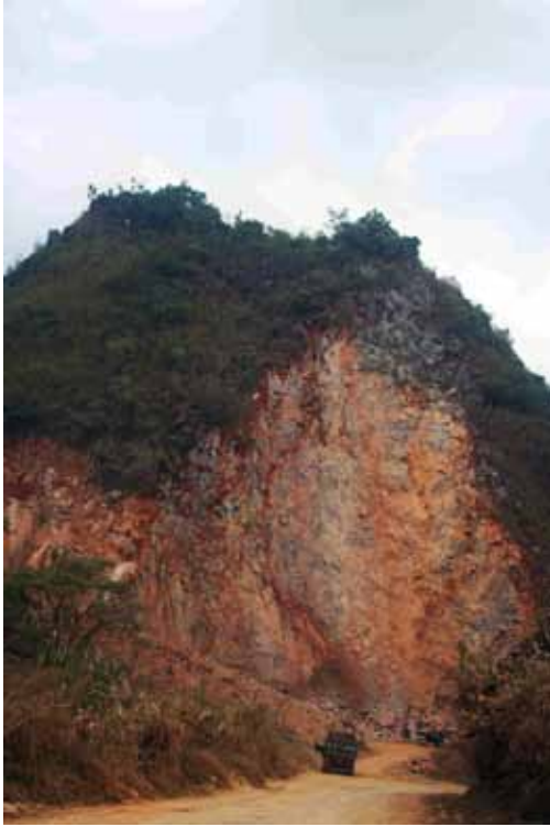
Fig. 12. Destruction of vegetation and mountains by mining and road construction in Dien Bien Province

action, the forest here will be completely destroyed in the near future. The survival of sensitive native species, including P. canhii , after forest destruction will be impossible (Figs. 9, 10, 11, 12).