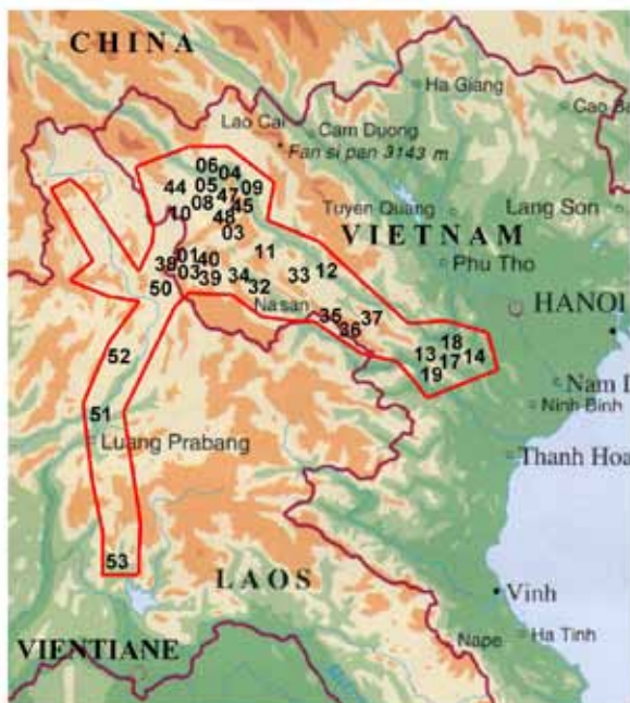
Fig. 3. Studied area of NE Indochina (outlined with red line) and localities of field work designated with black figures.

Paphiopedilum canhii is known from a single locality of Dien Bien province near the Laotian border (Fig. 3). This area contains alluvial valleys, shale hills and low mountains, with isolated, rocky mesas or mountains of highly eroded limestone (Fig. 4). These are spectacular formations with rocky, vertical cliffs commonly up to 2600 to 3250 ft above sea level (800-1000 m), but occasionally reaching as high as 4200 to 4600 ft a.s.l. (1300-1400 m) (Fig. 5). Such habitats are home to many native slipper orchids. Most inaccessible mountain tops or cliffs in northwestern Vietnam still retain remnants of rich primary forests. The highest level of species diversity and endemism was observed in this area compared to any other mountain formations in the country. During the fieldwork in these degraded remnant forest patches, numerous rare and strictly endemic plant species were located, including Paphiopedilum canhii .