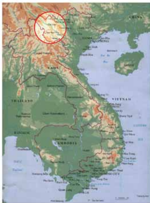
Fig. 2 Area of field explorations for Paph. canhii in Indochina and Vietnam